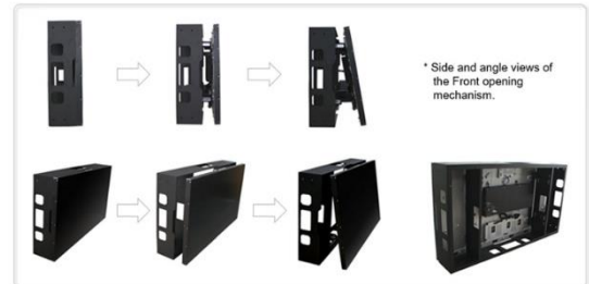
* Side and angle views of the Front opening mechanism.